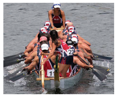
A steersperson handles the rudder in the stern and a drummer beats out the rhythm in the bow for the 20 paddlers who sit side by side in rows of ten in the traditionally decorated teak Dragon Boats.

sits facing the crew, beating the drum to the stroke rate of the paddlers. Each team races three times throughout the day, with a chance to vie for champion of one of seven divisions. The race course is 450 meters long, and teams race from east to west in a straight line.